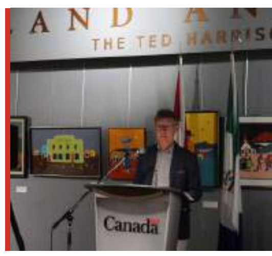
Making a tourism announcement at the MacBride Muse-