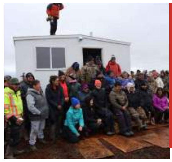
Watching the ribbon cutting ceremony at Koanuck's River Cabin with the Aullaviat/Anguiarvik Working Group

This announcement supports the repair of 108 units for members of CAFN, 13 new single-family homes and repairs of eight homes for Little Salmon/Carmacks First Nation, repairs to 141 homes for members of Tr'ondëk Hwëch'in First Nation, and the repair of four apartments and 12 beds in Watson Lake for women and children fleeing violence.