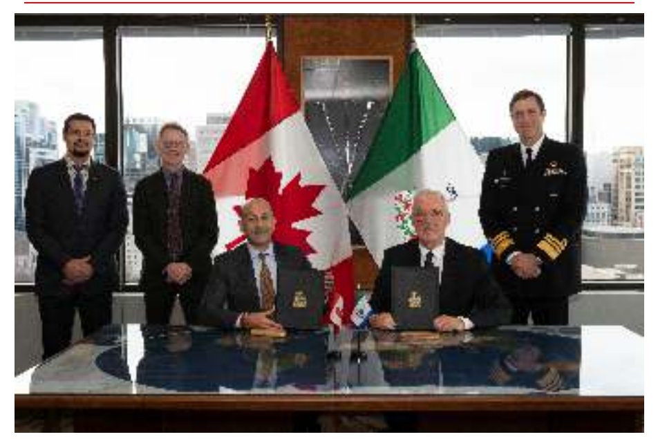
Minister Blair and Premier Pillai sign a letter of intent to establish a Reserve presence in Whitehorse, Yukon

To kick off Yukon Days, I was happy to join Minister Blair and Premier Pillai in the signing a letter of intent to establish a Reserve presence in Whitehorse.