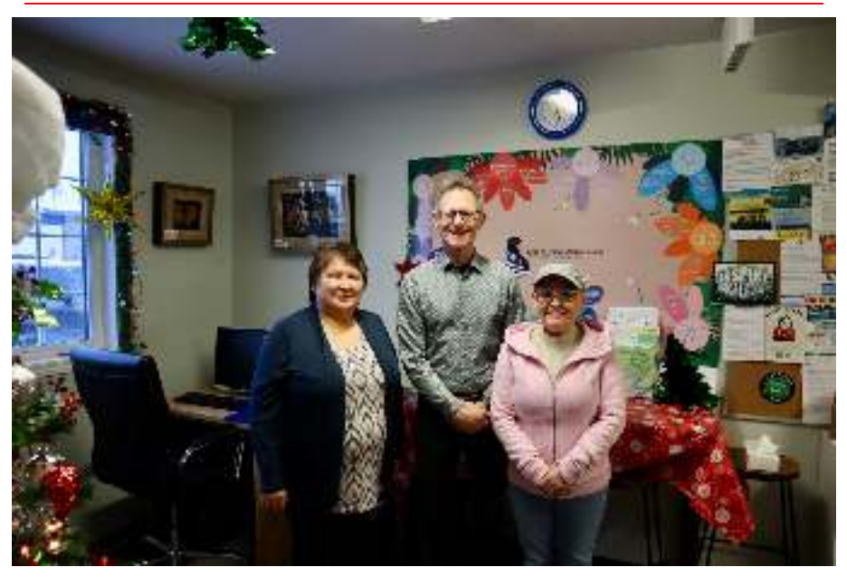
Funding to support Indigenous-led projects in the Yukon

I was proud to connect with the Yukon Aboriginal Women's Council and learn about how they are using the over $800,000 in federal funding - including to create a community hub for families of missing and murdered Indigenous people in the Yukon and throughout the North.