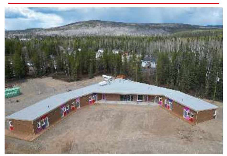
Liard First Nation Celebrates Opening Elders Housing Complex in Watson Lake: Strengthening Community Connections