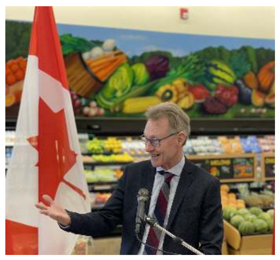
This will provide Yukoners with financial relief over the holiday period and stimulate spending in the following months. I recognize that our small businesses have faced numerous challenges this season, and I hope this measure will boost sales during a typically quiet time of year. Make sure to get out there and support locals when shopping this holiday season!